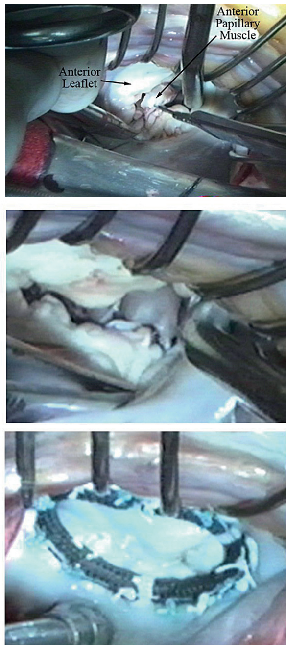
Figure 2: Top panel: The chordal attachments of the anterior papillary muscle to the left half of both leaflets have been divided, and the fibrotic and hypertrophied anterior papillary muscle, arising anomalously to the left and superiorly, is being excised flush with the ventricular endocardium. Center panel: The detached left halves of both leaflets are evident, and a posterior papillary muscle head is identified, to which the leaflets will be reattached with Gore-Tex artificial chords. Bottom panel: View of the fully competent valve after repair. The ventricle has been pressurized with cold saline, and there is no residual leak. The four artificial chords constructed from the posterior papillary muscle to the left halves of both leaflets are evident.

Mitral insufficiency is common in HOCM, and mitral structural abnormalities exist in a significant proportion of patients. A report from the Royal Brompton Hospital in 1997 (25) described an 'abnormal papillary muscle of the mitral valve obstructing the outflow trac-